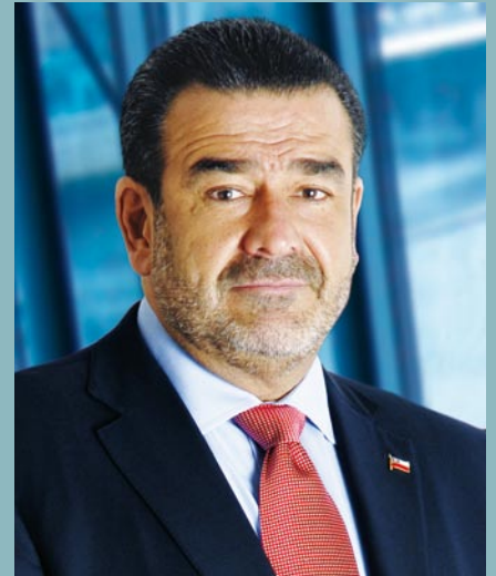
Andrónico Luksic Craig Vice Chairman of the Board