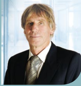
Hernán Büchi Buc Director