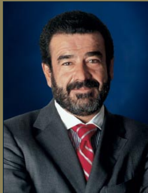
Andrónico Luksic C. Vice Chairman